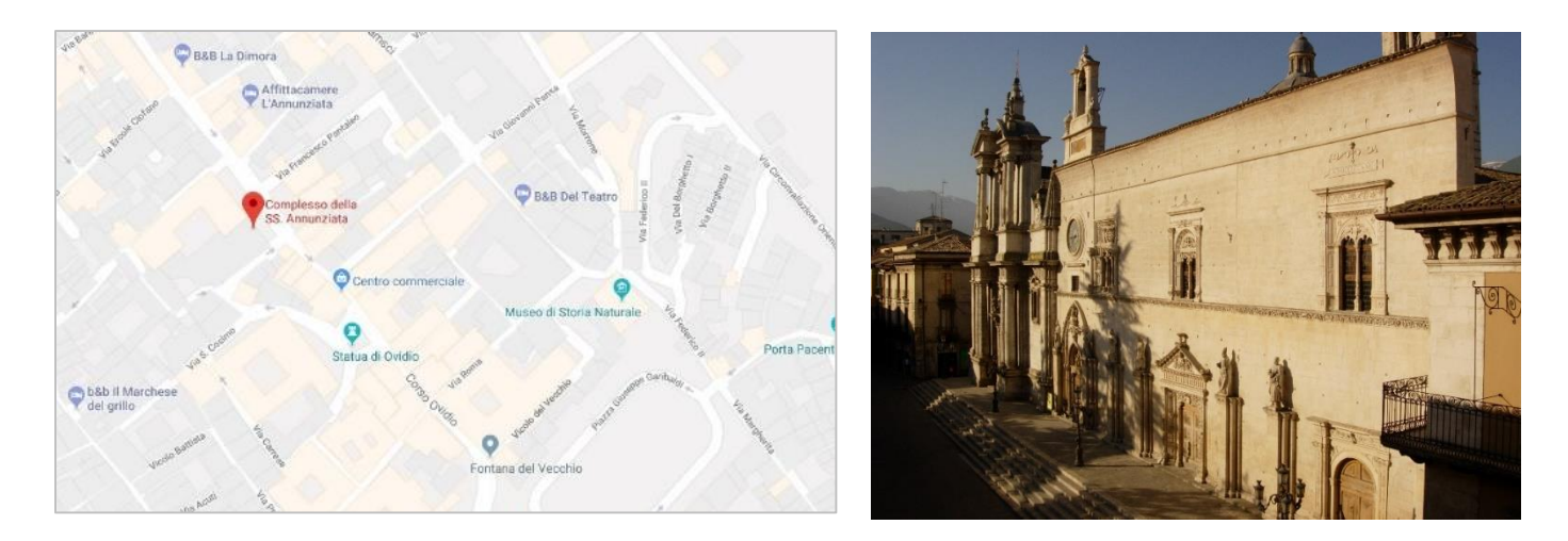
Fig. 2. The complex of Annunziata where the plenary sessions will take place.