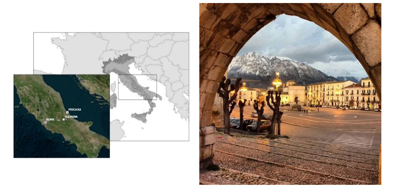
Fig. 1. Location of Sulmona and a view of Piazza Garibaldi and Monte Morrone at sunset.

Sulmona is known for being the home of the Italian confectionery known as "confetti", the traditional sugar-coated almonds.