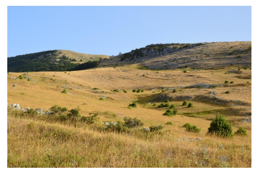
Fig. 6. A view from the slope towards Tavola Rotonda and itinerary of the excursion.

Mountain boots and clothes, hat and sunscreen will be necessary.