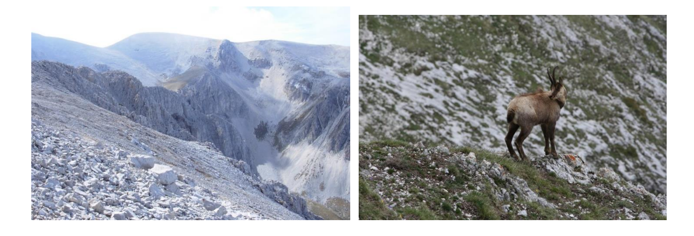
Fig. 5. Anfiteatro delle Murelle (one of the mid-stops of the Mid-conference excursion) and a Chamois (Rupicapra pyrenaica ornata) frequenting the site.

Mountain shoes and clothes, hat and sunscreen will be necessary.