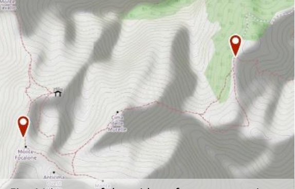
Fig. 4 Itinerary of the mid-conference excursion

1. S. Bartolomeo Hermitage at 610 m a.s.l., embedded in the rock in a context of dry grasslands ( Bromopsis erecta, Brachypodium rupestre, Trachynia distachya ), cultivated and uncultivated fields, thermophilous deciduous shrubs;